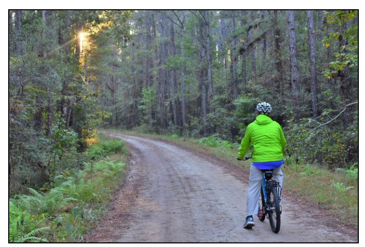
Late fall, sunrise ride on the Huger & History Ride route. On Conifer Rd.