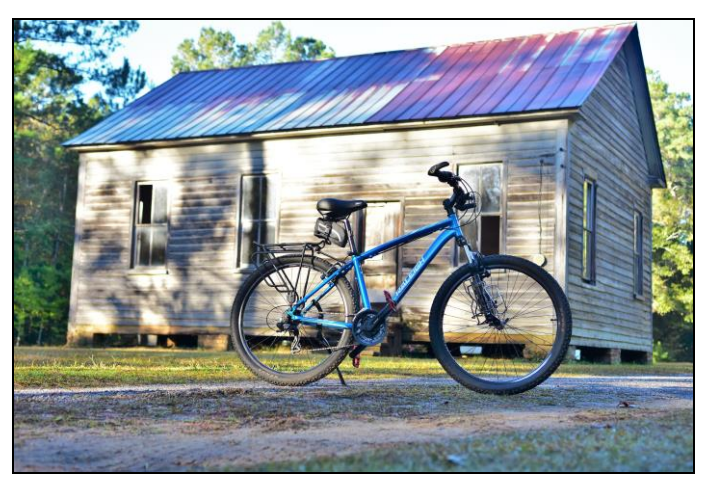
Bikes & History! At the historic Eccles United Methodist Church in Huger.