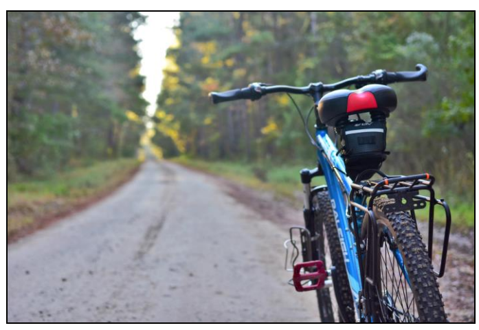
There are miles of easy dirt/gravel roads for the entire family.