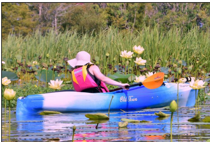
Marveling at the beautiful Golden Lotus of The Hatchery.