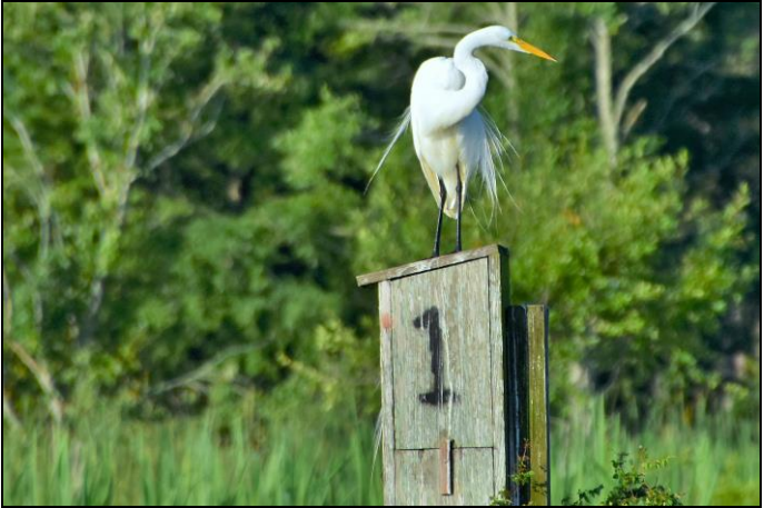
This protected waterfowl area is full of surprises! Pictured: Egret.