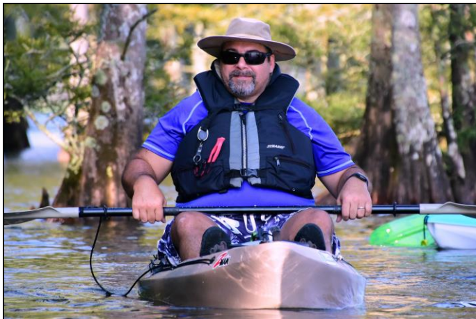
Circumnavigating the cypress lined big island at The Hatchery.