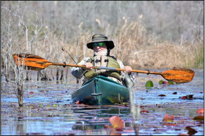
Paddling beautiful north Lake Moultrie in the Bulltown Flats.