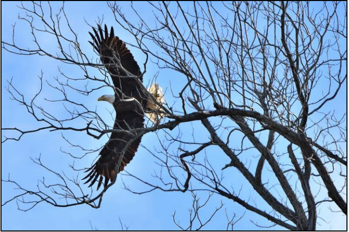
Bald Eagles are a common sight on north Lake Moultrie.