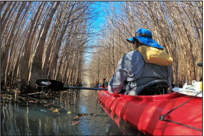
Scenic, narrow path in the Bulltown Flats.