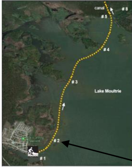
Map 1 of 2 - Santee Canal N. Moultrie

This map corresponds with route directions numbered 1 - 5, and 8.