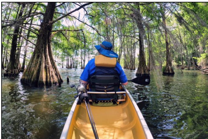
The eerie and beautiful trees are the highlights of this awesome Blueway.