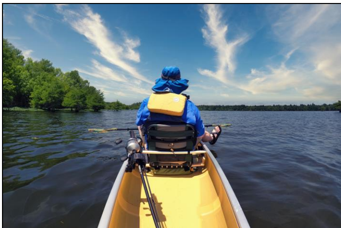
You'll cross a little open water to reach this Blueway's namesake.