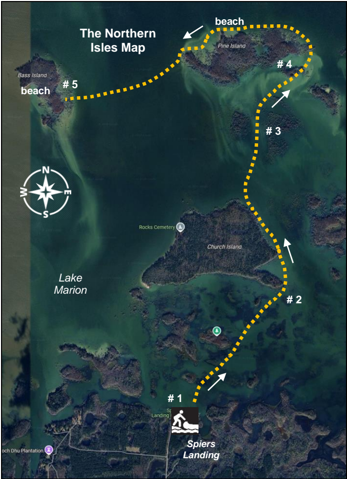
This map corresponds with route directions numbered 1 - 5 on page 6.