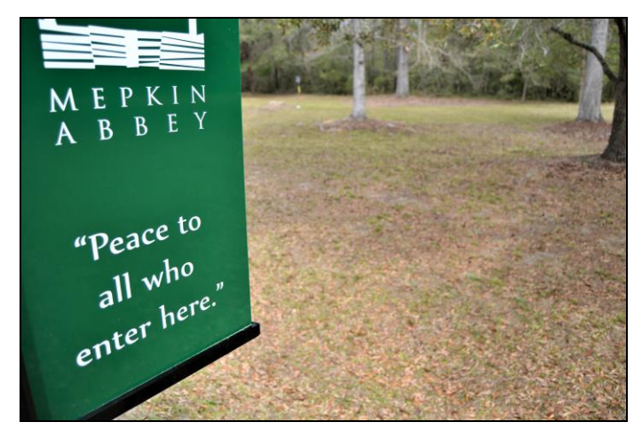
Appropriate message to all who visit Mepkin Abbey.