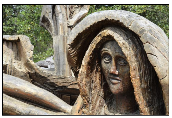
Unique wood craving statues at Mepkin Abbey.