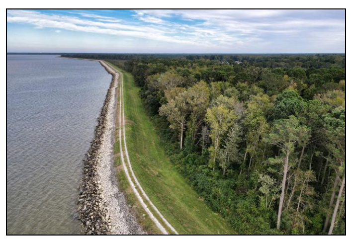
You'll bike along a long, flat and fast water impoundment.