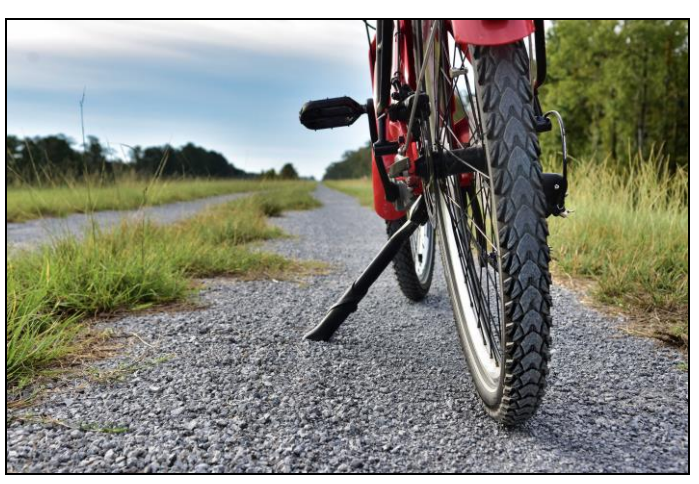
The riding surface is small gravel; smooth and fast!