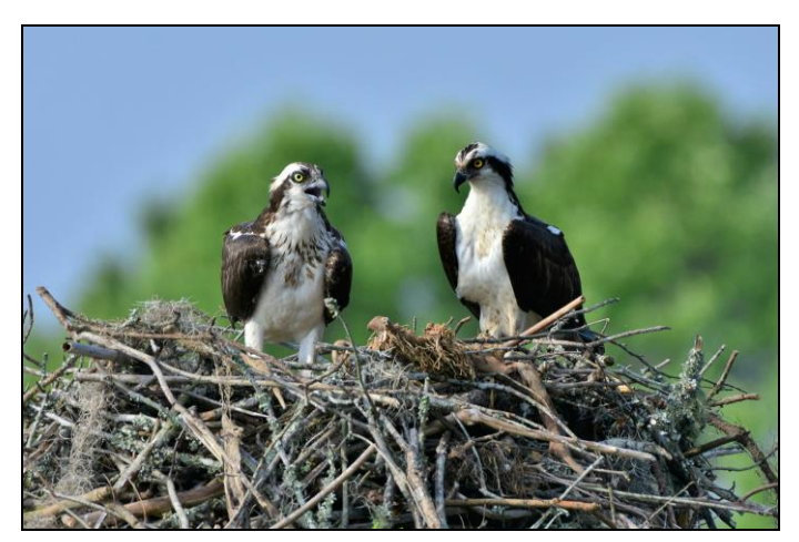
Osprey pairs are a common sight on Lake Moultrie for over the year.